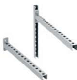
Wall rail support SPWR